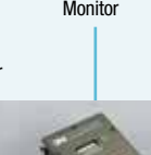
W-2808/37027 CO Monitor Retrofit Kit

IMPORTANT: These filter and regulated panel products do not produce Grade-D breathing air. The employer is required to ensure that the compressed air used with any supplied air system meets the requirements for Grade-D breathing air per the Compressed Gas Association Commodity Specification G-7.1-1997. In Canada, refer to CSA Standard Z180.1 for the quality of compressed breathing air.