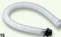
H-115 Breathing Tube