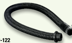
GVP-122 Breathing Tube